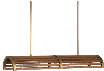
Shown in brass / chestnut

PRODUCT DIMENSIONS . . . . . Downrod Lengths: (1) 6", (3) 12" included.