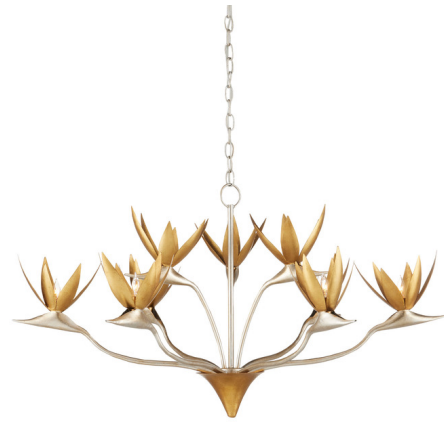
Shown in contemporary gold & silver leaf

PRODUCT DIMENSIONS . . . . . Adjustable Height: 28.25" to 95.75"