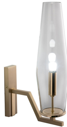
Shown in satin brass / polished brass / clear

The Frida Wall Sconce possesses a strong but elegant presence and a refined design that will complement both modern and traditional spaces alike. The handcrafted glass shades combine both smooth and angular lines, a motif that is repeated in the sconce's angled bracket arm. Includes mounting plate to cover standard US junction box.