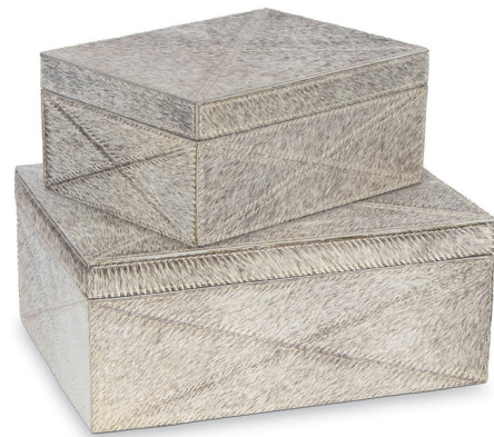
Shown in grey hide

The Andres Box Set will stand out in any space with the unique texture of genuine hair on hide. Both stylish and functional, Andres will serve as a decorative object when it is not being used to store items. Due to natural variations in the hide, each basket is unique. Includes one set of two boxes.