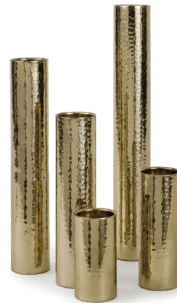
Shown in polished brass

The Hammered Bud Vase Set includes five slim, cylindrical vases of varying height in Polished Brass finish with a hammered texture. The vases' slim size is perfect for holding single stems, or they can also double as candleholders.