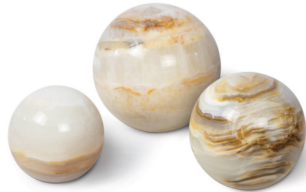
Shown in jade stone

The Jade Sphere Set includes a trio of polished jade orbs of various sizes that will add a beautiful visual texture to any space. Natural variations in the jade's color ensure that each sphere is a unique piece of natural art.