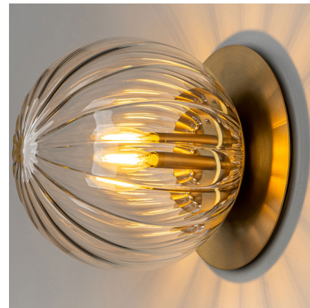
Shown in lacquered burnished brass / dries ribbon

The Pulsar Wall Sconce features a simple geometric design that will complement a variety of interiors. The globe shaped glass shade is supported by a round metal backplate for a smooth, symmetrical look. Available with Matte Opal or Matte Marbled glass or transparent Dries Ribbon textured glass.