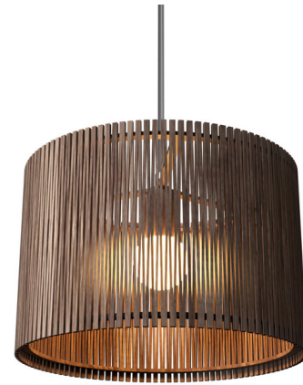
Shown in american walnut

The Living Hinges Drum Pendant blends clean lines with a touch of outdoor charm, perfect for elevating your interior space. The slatted drum shaped natural veneer shade casts soft, warm light and gentle shadows throughout your room. Note: Cord color varies by finish and may not be as shown. Please refer to Preset Cable Options image.