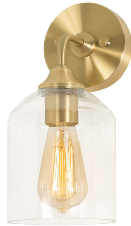
Shown in satin brass / clear

Merging the past with the present, the William Wall Sconce offers a new interpretation of vintage industrial design, with its bell shaped clear glass shade and sleek metal frame. Try an Edison bulb to complete the nostalgic look. This sconce is perfect for lighting hallways, living rooms, or bathrooms. Dimmable via Triac or electronic low voltage (ELV) dimming.