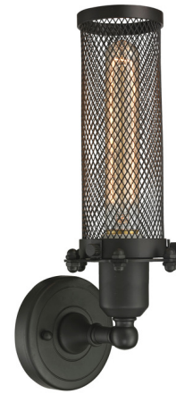
Shown in oil rubbed bronze

COLOR RENDERING . . . . . 90 CRI LAMP COLOR . . . . . 2700K LUMENS/WATT . . . . . 100.00 LUMINOUS FLUX . . . . . 500 lumens