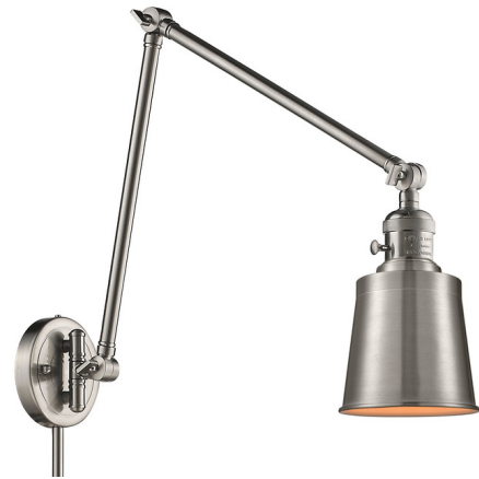
Shown in brushed satin nickel

The Addison Plug-In Swing Arm Wall Sconce features a versatile, vintage-inspired design that will complement any interior. The tapered, bell-shaped shade is supported by a sleek, segmented arm with adjustable locking hinges that allow the shade to be angled and moved up and down and side to side. Two metal tube cord covers are included. On/off switch located on socket.