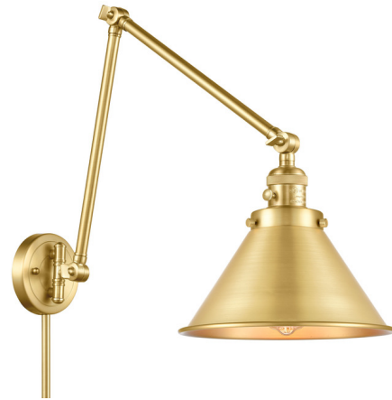
Shown in satin gold

The Briarcliff Plug-In Swing Arm Wall Sconce features a conical metal shade suspended from a round canopy and sleek, segmented metal arm. Adjustable locking hinges allow the shade to be angled and moved up and down. Two metal tube cord covers are included. On/off turn switch located on socket.