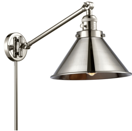
Shown in polished nickel