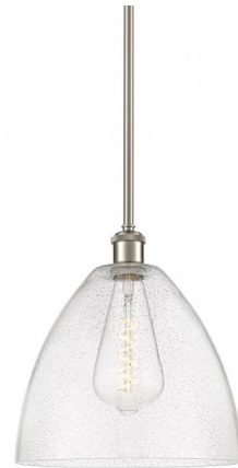
Shown in brushed satin nickel / clear seedy

PRODUCT DIMENSIONS . . . . . Downrods: One 6" and Two 12" Included