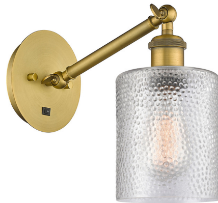
Shown in brushed brass / clear ripple

The Cobleskill Swing Arm Wall Sconce features an elegant and refined aesthetic that will complement a variety of interior decor styles. The cylindrical glass shade is supported by a circular backplate and sleek tubular arm. Adjustable locking hinges on the arm allow the shade be raised, lowered, and angled up and down to aim light where it is needed most. On/off switch located on backplate.