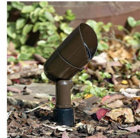
Shown in bronze

BL5016 Aluminum Bullyte with Mounting Stake is fabricated from die cast marine grade aluminum alloy with fully adjustable swivel arm with vibration proof locking teeth and fully adjustable double gasketed shroud. Thermoset polyester powdercoat finish in Black, or Bronze. Clear tempered glass affixed at 10 degree angle for natural cleaning. Includes 1.4 inch diameter x 9.5 inch length S7 PVC stake with integral .5 inch NPS fitter. Optional junction box accessories available, sold separately. One 50 watt 12 volt GU5.3 MR16 lamp is required, but not included. Covered MR16 recommended to protect inner capsule of lamp. Pre-wired with 3 foot pigtail of 18-2 AWG wire. Includes low voltage quick connector LVC3 for easy hook up to the low voltage supply cable, sold separately. 2.8 inch diameter x 5.8 inch length. ETL listed for wet locations. Required remote transformer and optional mounting accessories sold separately.