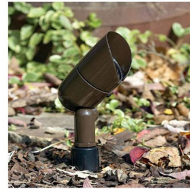
Shown in bronze

BL5016 Aluminum Bullyte with Mounting Stake is fabricated from die cast marine grade aluminum alloy with fully adjustable swivel arm with vibration proof locking teeth and fully adjustable double gasketed shroud. Thermoset polyester powdercoat finish in Black, or Bronze. Clear tempered glass affixed at 10 degree angle for natural cleaning. Includes 1.4 inch diameter x 9.5 inch length S7 PVC stake with integral .5 inch NPS fitter. Optional junction box accessories available, sold separately. One 50 watt 12 volt GU5.3 MR16 lamp is required, but not included. Covered MR16 recommended to protect inner capsule of lamp. Pre-wired with 3 foot pigtail of 18-2 AWG wire. Includes low voltage quick connector LVC3 for easy hook up to the low voltage supply cable, sold separately. 2.8 inch diameter x 5.8 inch length. ETL listed for wet locations. Required remote transformer and optional mounting accessories sold separately.