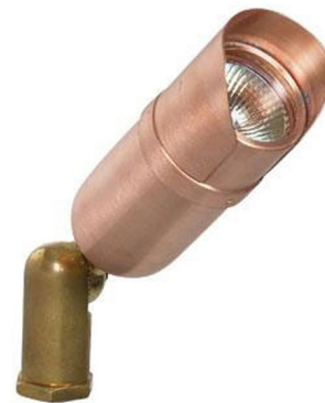
Shown in copper

CUL16 Halogen Bullyte with Mounting Stake features a fully adjustable natural brass swivel arm and brass locknut and fully rotatable shroud in deep-drawn solid copper. Finish in Natural Copper is bright polished, untreated copper which will age naturally to a fine dark copper patina. Includes 1.4 inch diameter x 9.5 inch length S7 PVC mounting stake. Fixture features integral .5 inch NPS fitter. Pre-wired with 3 foot pigtail of 18-2 AWG wire. Includes low voltage quick connector LVC3 for easy hook up to the low voltage supply cable, sold separately. Required low voltage transformer and optional mounting accessories sold separately. NOTE: This is a discontinued floor model and limited to quantity on hand.