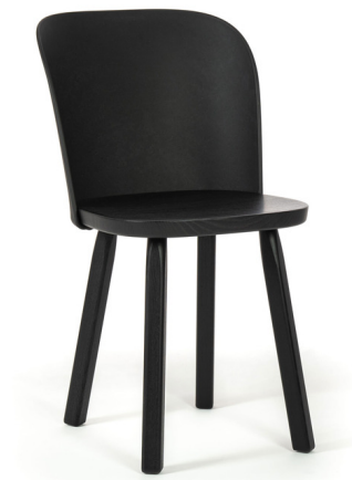
Shown in ash black / black

The Alpina Chair Set of 2, designed by British designers Edward Barber and Jay Osgerby, defines a new archetype for chairs from a perspective of all-round sustainability. It's inspired by a classical model of the alpine furniture tradition, known for its simple design and multifunctional uses. It's elegant and versatile, capable of adapting to both traditional and more contemporary environments. Simple and clean, yet curvaceous and enveloping, the new chair combines a solid ash wood frame (FSC certified) with an injection molded backrest in bio-based polypropylene that derives 100% from recyclable materials.