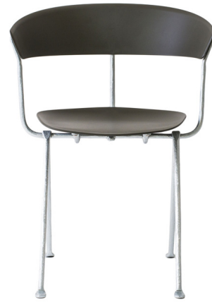
Shown in galvanized / dark green

The Officina Indoor/Outdoor Chair explores the possibility of establishing a new creative language while working with an ancient fabrication process such as iron forging. The chair features a wrought iron frame with a galvanized or grey anthracite painted powder. The seat and back's material is in a standard injection-molded polypropylene with glass fiber added (suitable for outdoor use).