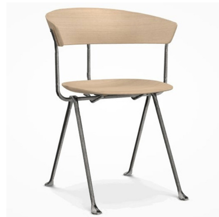
Shown in galvanized / natural wood

The Officina Wood Chair explores the possibility of establishing a new creative language while working with an ancient fabrication process such as iron forging. The chair features a wrought iron frame with a galvanized or grey anthracite painted powder. The seat and back's material is in plywood.