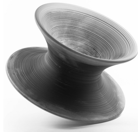
Shown in black / white

Thomas Heatherwick has produced a startling twist on conventional furniture design: a functional chair formed from a single profile rotated through 360 degrees. The Spun Rotating Low Chair displays Heatherwick's flair for challenging rules and teasingly plays with the notion of a static piece of sculpture becoming a playful piece of design. When upright Spun is a sculptural vessel and it is only when it is laid on its side that the playful possibilities of its form come to light. Spun allows the sitter to swivel in a circular rocking motion, including being able to rotate in a complete circle.