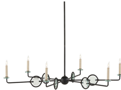
Shown in blacksmith / clear

PRODUCT DIMENSIONS . . . . . Downrod Lengths: (1) 6", (3) 12" included.