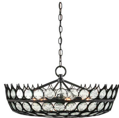
Shown in satin black / clear

PRODUCT DIMENSIONS . . . . . Adjustable Height: 18" to 86"