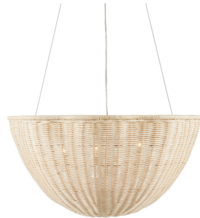
Shown in vanilla / bleach

PRODUCT DIMENSIONS . . . . . Adjustable Height: 28" to 130"