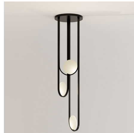
Shown in black / frosted

LAMP COLOR . . . . . 3000K LUMENS/WATT . . . . . 17.05 LUMINOUS FLUX . . . . . 450 lumens