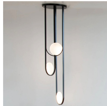
Shown in black / frosted

The curvilinear shape of the Ellipse Chandelier is inspired by the moon's elliptical orbit around Earth. A trio of frosted acrylic discs illuminated by integrated LEDs evoke the image of the moon in its gibbous phase as it enters and exits the full moon. Ellipse's interesting arrangement of simple shapes creates an attention-grabbing fixture with a sculptural prescence. Includes canopy-mounted 24V DC phase dimmable driver and circular canopy in Black (for Black finish) or White (for White, Brushed Brass, Brushed Copper, and Brushed Stainless Steel finishes).