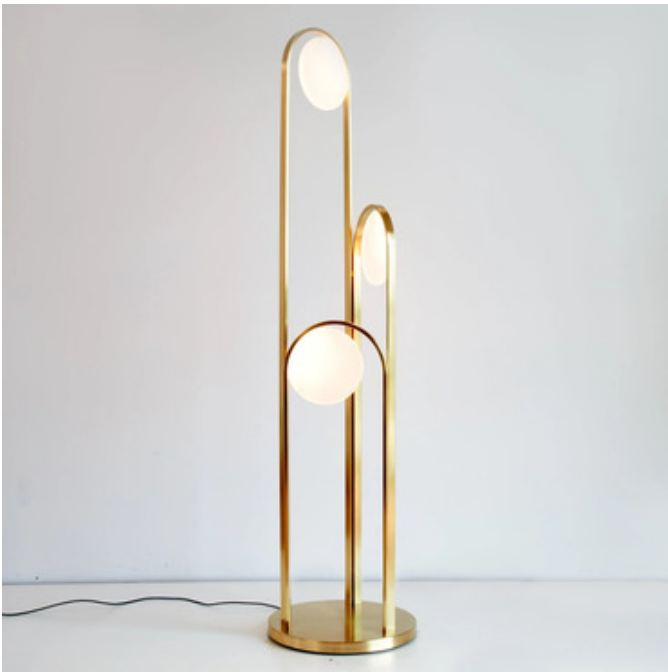
Shown in: Brushed Brass / Frosted

The curvilinear shape of the Ellipse Floor Lamp is inspired by the moon's elliptical orbit around Earth. A trio of frosted acrylic discs illuminated by integrated LEDs evoke the image of the moon in its gibbous phase as it enters and exits the full moon. Ellipse's interesting arrangement of simple shapes creates an attention-grabbing fixture with a sculptural presence. Includes 24V DC, phase-dimmable driver. On/off switch located on cord.