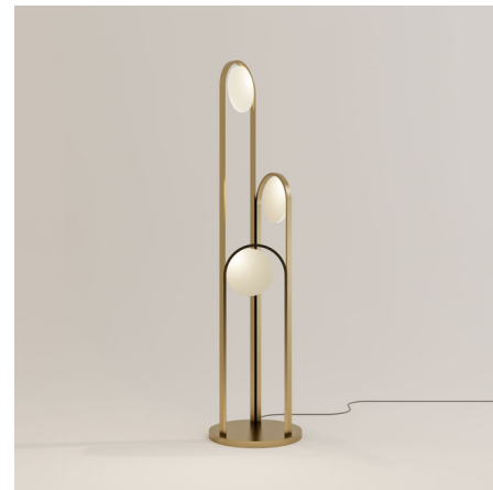
Shown in brushed brass / frosted

The curvilinear shape of the Ellipse Floor Lamp is inspired by the moon's elliptical orbit around Earth. A trio of frosted acrylic discs illuminated by integrated LEDs evoke the image of the moon in its gibbous phase as it enters and exits the full moon. Ellipse's interesting arrangement of simple shapes creates an attention-grabbing fixture with a sculptural presence. Includes 24V DC, phase-dimmable driver. On/off switch located on cord.