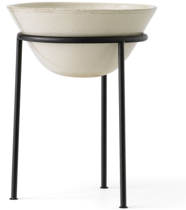
Shown in black / ivory

The Daiza Planter features a conical ceramic body supported by a metal tripod stand. The planter is coated with a glossy ivory glaze that gives the piece a neutral color and rich texture. Group multiple planters from the Daiza collection to display a lush array of houseplants. Intended for indoor use.