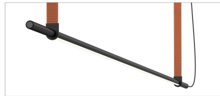
Shown in black / burnt orange