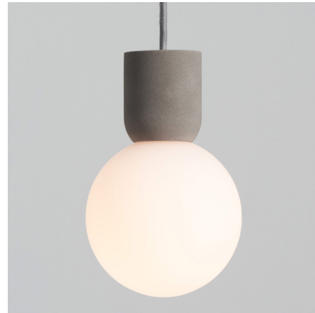
Shown in concrete gray / matte opal

The Castle Glo Pendant pairs the smooth texture of a mouth-blown opal glass sphere with the organic nature of concrete in a harmonious match. This minimalist yet bold statement integrates seamlessly into many interior settings from modern farmhouses to urban studios.