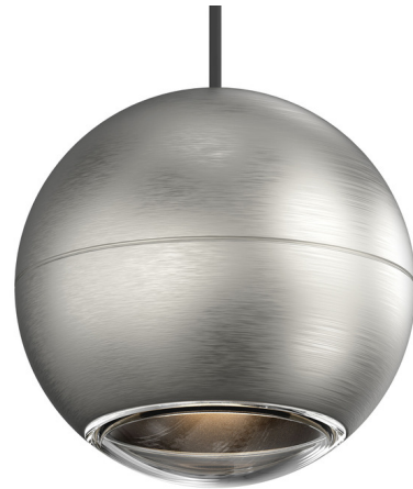
Shown in natural anodized / clear

COLOR RENDERING . . . . . 90 CRI LAMP COLOR . . . . . 3000K LUMENS/WATT . . . . . 65.63 LUMINOUS FLUX . . . . . 525 lumens