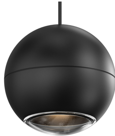
Shown in textured black / clear

COLOR RENDERING . . . . . 90 CRI LAMP COLOR . . . . . 3000K LUMENS/WATT . . . . . 65.63 LUMINOUS FLUX . . . . . 525 lumens