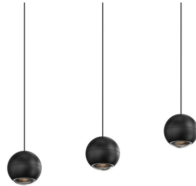
Shown in textured black / clear