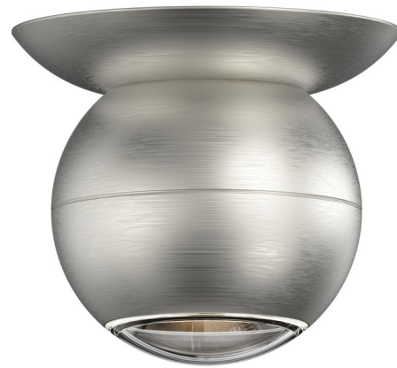
Shown in natural anodized / clear