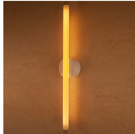
Shown in dark gray / frosted

The Kilter Wall Light adds a clean simplicity to your interior space. Features a delicate confluence of the frosted glass, housing the linear light source, subtly exposing the internal filament when illuminated. A rubber gasket protects the bulb and fixture from moisture, making it an ideal bath bar or vanity light, while the clean and contemporary construction references its heritage in architectural lighting. Tala logo detailing on fixture.