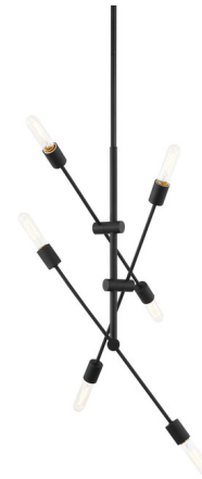
Shown in midnight black

PRODUCT DIMENSIONS . . . . . Downrod Lengths: (1) 6", (3) 12" included.