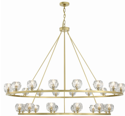
Shown in soft brass / crystal

PRODUCT DIMENSIONS . . . . . Chain Length: 72" COLOR RENDERING . . . . . 80 CRI LAMP COLOR . . . . . 3000K LUMENS/WATT . . . . . 9714 LUMINOUS FLUX . . . . . 340 lumens