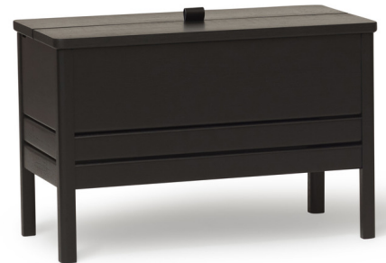
Shown in black stained oak

A Line Storage Bench is an updated version of the classic storage bench - where functionality meets clean form. A solid and versatile bench with slightly reduced dimensions and minimalistic characteristics. The lid is lifted via a small leather handle and is held in place by the construction when in use. The lower cut of the two legs angles the piece so as to give it a feeling of being lifted up making the overall design solid and robust, but also stylish. Note: The 43.9 inch option includes 2 storage compartments. Note: Not all options are available.