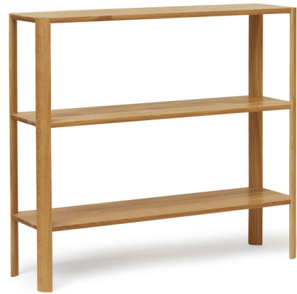
Shown in natural oak

The Leaf Shelf is an effort to create a shelving system striking an ultimate balance between aesthetics, stability and packability. It is characterized by a very pure aesthetic, the aim being that the leg pillars are the center of attention. With an organic and clean expression being sculpted in the shape of a leaf they give the system its signature look. The construction itself is also breaking ground in terms of stability, as it is entirely contained without any visible screws or extra stabilizing parts underneath the shelf.