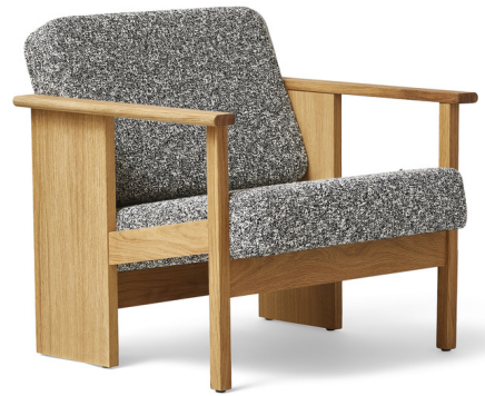
Shown in natural oak/ zero cotton

The Block Lounge Chair is a compact lounge chair with a distinctive wooden panel and a laid-back up-holstered wool overlay that combines enduring pure raw materials and soft ergonomic shapes. The chair is intended as a versatile piece of furniture that provides generous comfort despite its minimal footprint. The wool canvas features detailed knitting and stitching visible on both the back and front of the seat. The Block lounge chair is perfect for small spaces as well as large open areas with repetitive outlines.