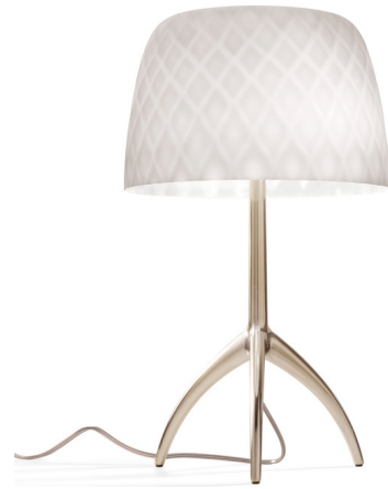
Shown in champagne / pastilles

COLOR . . . . . Pastilles BODY FINISH . . . . . Champagne WATTAGE . . . . . 40W DIMMER . . . . . N/A DIMENSIONS . . . . . 10.5"W x 17.625"H BULB NOT INCLUDED . . . . . 1 x JCD/G9/40W/120V Halogen OTHER BULB OPTIONS . . . . . 1 x JCD/G9/120V LED COUNTRY OF ORIGIN . . . . . Italy