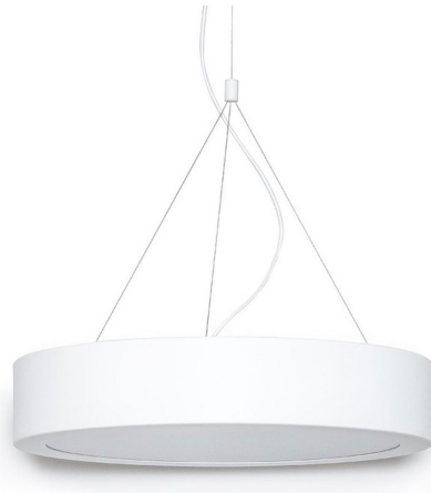
Shown in matte white / white

PRODUCT DIMENSIONS . . . . . Adjustable Cable Length: 98.4"