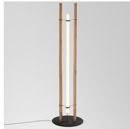
Shown in natural waxed bamboo / opal

The Ta-Ke Floor Lamp consists of a cylindrical glass shade suspended from bamboo posts for a unique combination of natural materials and contemporary shapes. The elongated shape of the glass tube is echoed in the bamboo poles but contrasted by the bamboo's inherent irregularities. The lamp is anchored by a round, powder-coated metal base that provides structural stability as well as visual weight. Dimmer switch located on cord.