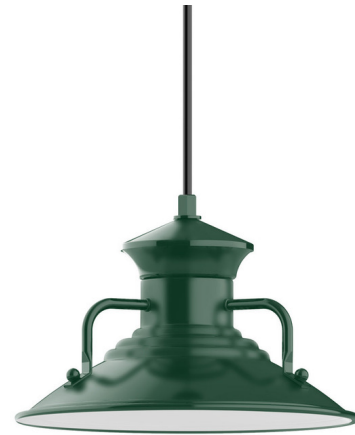
Shown in forest green

The Homestead Pendant adds the look of modern farmhouse with hints of industrialism to your interior space. The vintage, decorative cone shade, lined in white, cast warm shadows around your area. The Polyester powder coat finish provides color retention and scratch resistance.