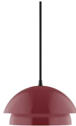
Shown in barn red

The Nest Pendant brings a playful beauty to your interior space. The nested dome shaped shades lined in white, casts warm shadows around your area. The Polyester powder coat finish provides color retention and scratch resistance.