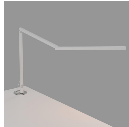
Shown in matte white