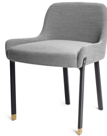
Shown in black / steelcut trio 124

The Blink Dining Chair features a versatile design that can coexist or stand out in a variety of interior settings. Its gently curved back and sides give it a modernist touch that contrasts with the sharper angles of its powdercoated steel legs. The feet are capped with brass-colored stainless steel for a decorative accent.