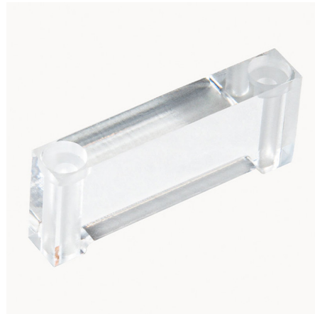
Shown in clear

The Pixels Standoff allows for translucent materials (granite, stone, etc.) to be installed on top of Pixels. Sold in a .50, .75, or 1 inch option. Designed for use with WAC Lighting Pixels Light Sheet. Sold as a 10-pack.