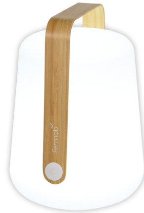
Shown in bamboo / white

LAMP LIFE . . . . . 50000 hours LAMP COLOR . . . . . CCT Select LUMENS/WATT . . . . . 80.00 LUMINOUS FLUX . . . . . 40 lumens