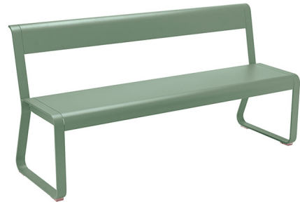
Shown in cactus

The Bellevie Bench with backrest is light and ultra stable. Designed in perfect harmony to slide underneath the Bellevie Dining table. Made from aluminum, its soft curves and contemporary design appeals to young and old for a garden or patio as guests come and go. Seats 3 people.