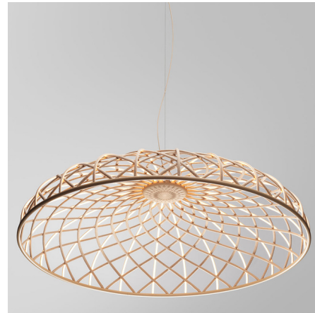
Shown in almond